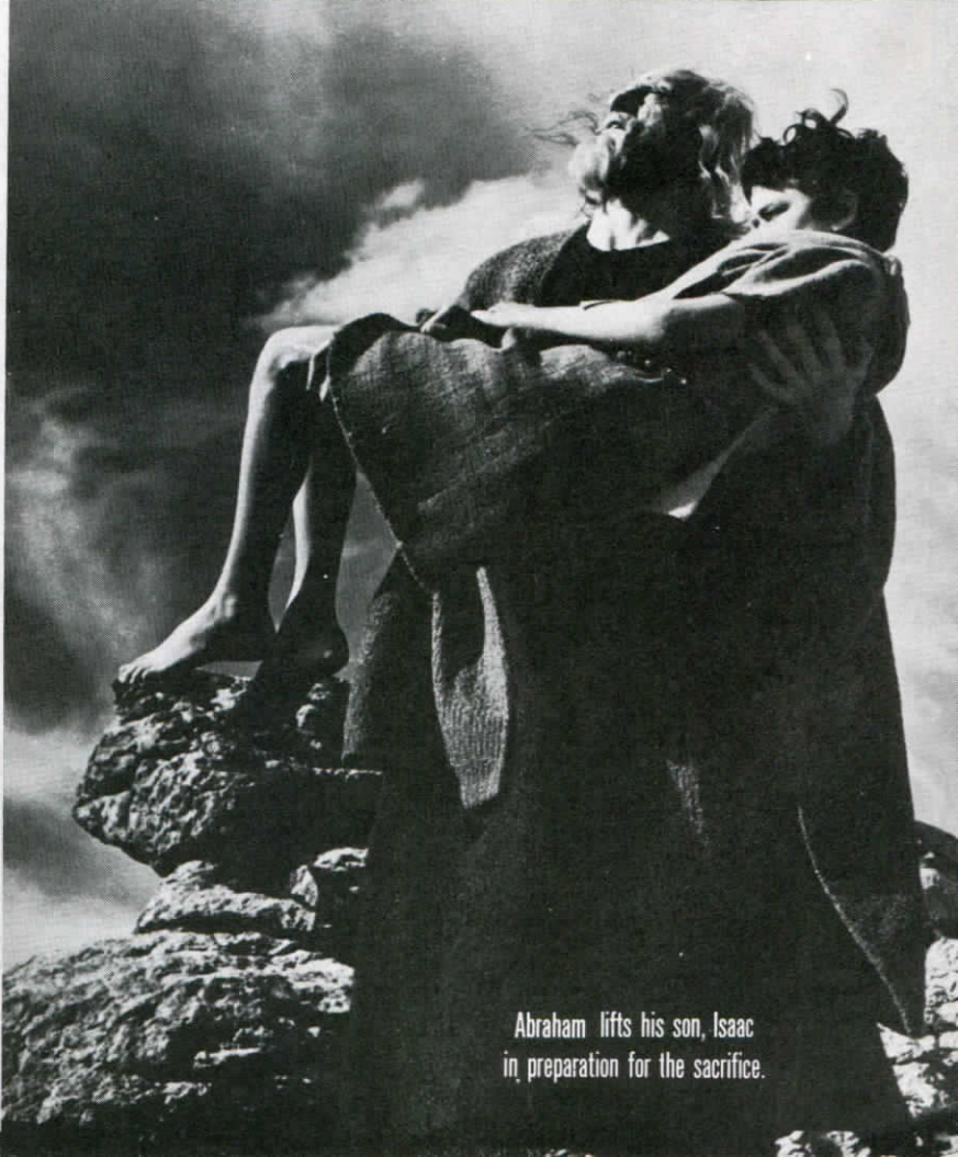
Abraham lifts his son, Isaac in preparation for the sacrifice.