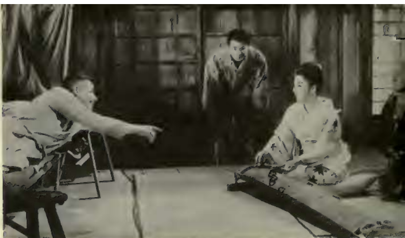
Glenn Ford, Marlon Brando, Machiko Kyo, Eddie Albert

The film score for TEAHOUSE OF THE AUGUST MOON is based primarily upon Okinawan folk music and performed on the samisen, koto, hichiriki, shakuhachi and percussion instruments. Music is employed only when music is either being sung or performed on the screen, except for the opening credits (abstracted from the final Teahouse scene). The song and dance music utilized is oriental music void of Western compositional techniques. This music plays a purely functional role throughout; the entrance of Lotus Blossom to Tobiki accompanied by the male Okinawans singing a joyful folk song; Lotus Blossom's captivating