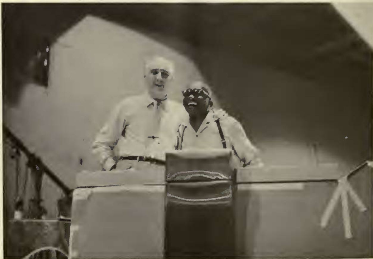
(Dimitri Tiomkin and Jester Hairston)