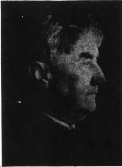
Ralph Vaughan Williams

function? By value I do not mean necessarily that it must sound equally well played as a concert piece, but I do believe that no artistic result can come from this complex entity, the film, unless each element, acting, photography, script and music are each in themselves and by themselves intrinsically good.